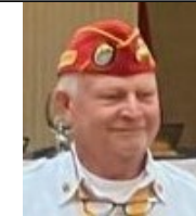
MARINE CORPS LEAGUE OFFICERS 2024-2025