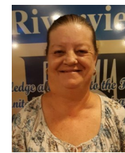
AMERICAN LEGION AUXILIARY OFFICERS 2024-2025