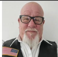
AMERICAN LEGION RIDERS OFFICERS 2024-2025