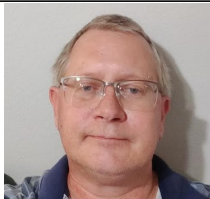
SONS OF THE AMERICAN LEGION OFFICERS 2024 - 2025