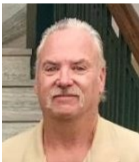
AMERICAN LEGION OFFICERS 2024-2025